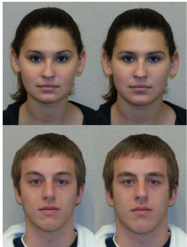
Fig. 1 Examples of a feminized (left column) and masculinized (right column) female and male face. Note that 2D face shape differs, but that other facial characteristics (i.e., skin color, texture, and identity) remain constant

Following previous research (e.g., Jones et al., 2007; Smith et al., 2009; Welling et al., 2007), we calculated the proportion of times